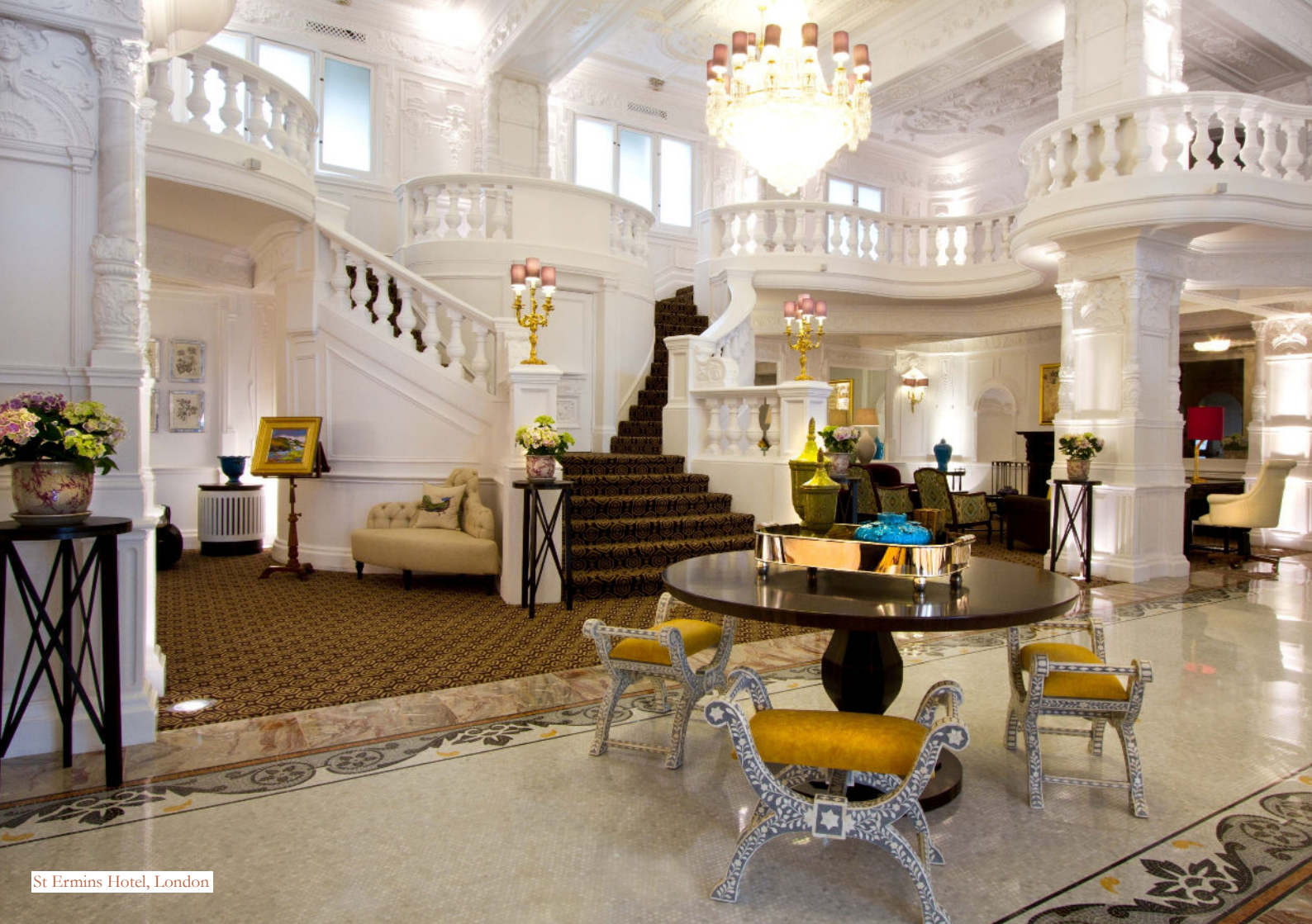
St Ermins Hotel, London