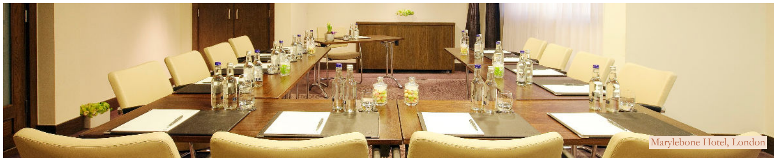
Marylebone Hotel, London