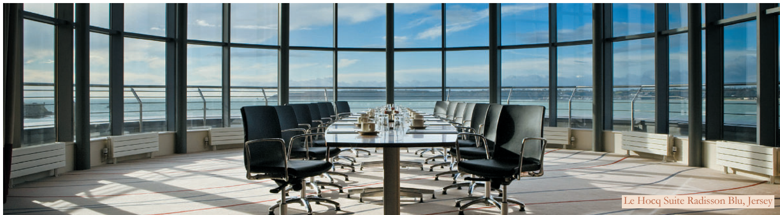
Le Hocq Suite Radisson Blu, Jersey