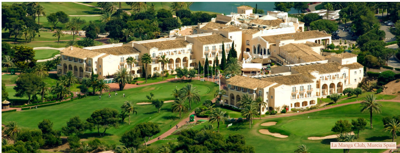
La Manga Club, Murcia Spain